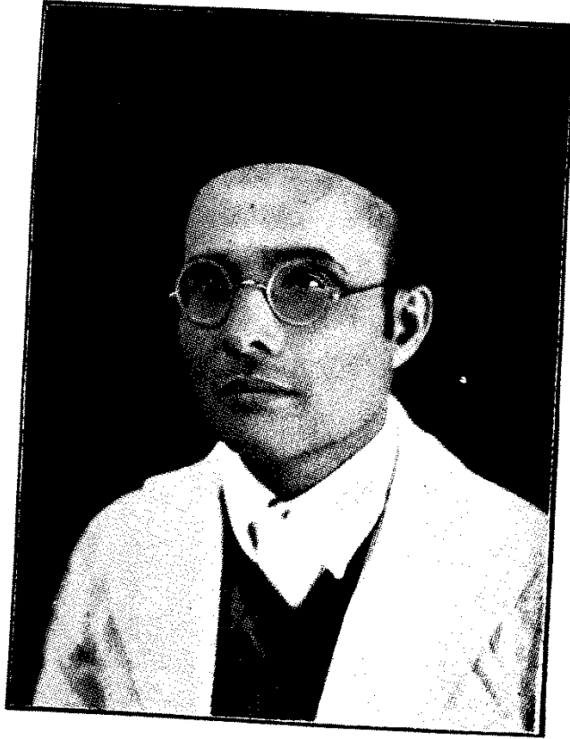
Shri Veer Vinayak Damodar Savarkar